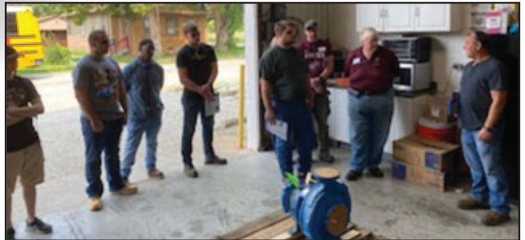
Bodine Electrical entices DHS students with stories of good pay and great work at a place that trains well and loves its employees!