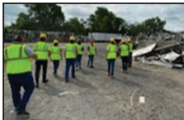
The CTE summer enrichment students trooping through Bryant Industries scrap yard, oohing and aweing at all the cool stuff!